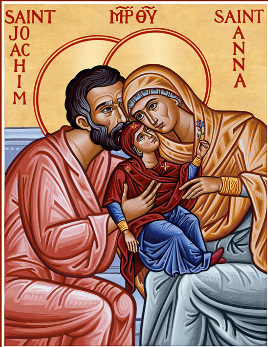
SAINTS JOACHIM AND ANNE, GRANDPARENTS OF JESUS CHRIST

Saint Francis Xavier Catholic Church | Stillwater, OK