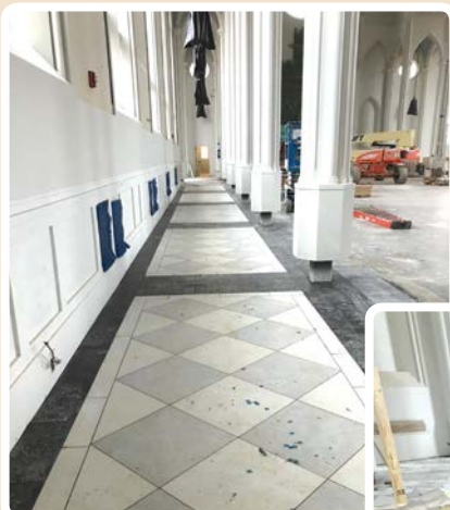
(left) Photo 3, Jan. 15, progress on ceramic floor tile at west side aisle in nave, looking north