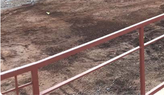
(right) Photo 2, Jan. 12, new railings along walk east of gym and east sidewalk leading to Education Wing, looking northeast